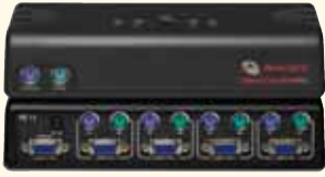
SwitchView PC switch

The Avocent SwitchView PC KVM desktop switches let you control up to four PS/2 computers from one keyboard, monitor and mouse. Lighted LED indicates which computer you are accessing and audible indicators confirm channel switching. With color-coded cables for easy installation, customisable channel selections and error-free boot-up, the SwitchView PC switch offers you a complete desktop KVM solution.